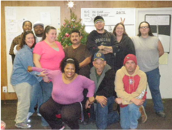
7 th Street Facility – Oakland, CA