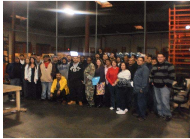
PCC SW Carson Facility – Carson, CA