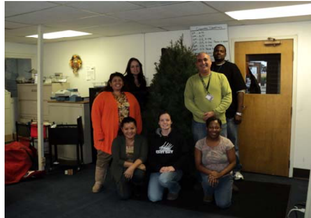
Direct Delivery – Oakland, CA