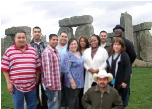
PTS Facility – Oakland, CA