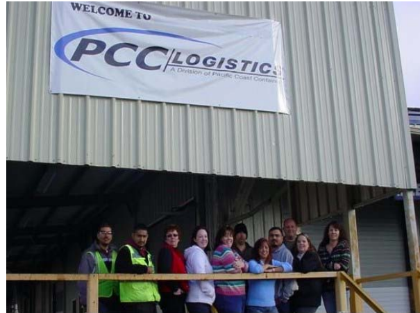
Tacoma Facility – Tacoma, WA