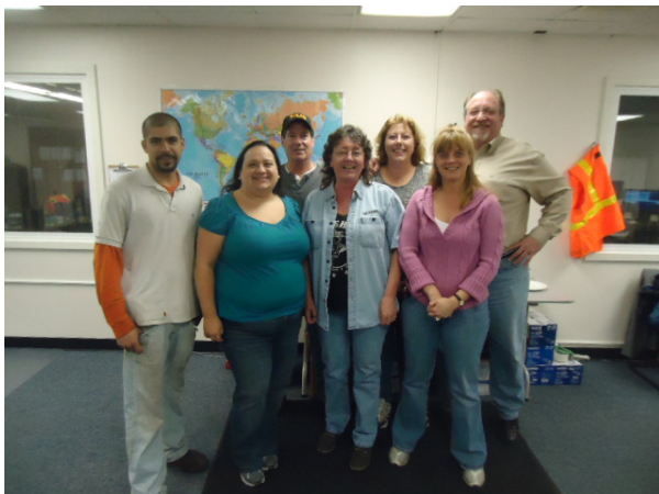
Duwamish Facility – Seattle, WA

As the Holiday Season is upon us, we find ourselves reflecting on the past year and on those who have helped to shape our business in a most significant way. We value our relationship with you and look forward to working with you in the year to come.