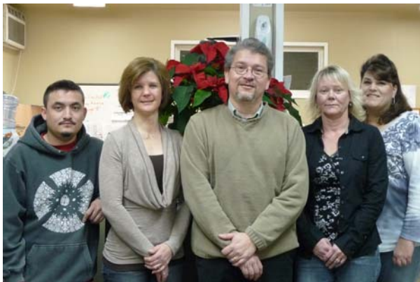
Harbor Island Facility – Seattle, WA