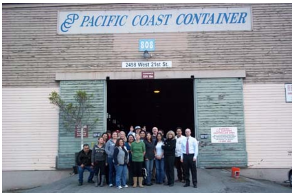
Building Facility – Oakland, CA