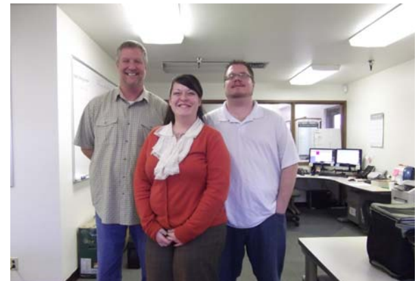
Direct Delivery – Seattle, WA