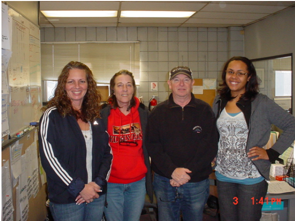
Occidental Facility – Seattle, WA